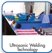
Ultrasonic Welding Technology

Minimizes streaking and banding. Improves overall print quality *