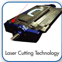
Laser Cutting Technology

Eliminates leaking. Maintains original cartridge critical gap alignment *