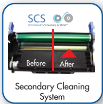
Secondary Cleaning System

Minimizes streaking and banding. Improves overall print quality *